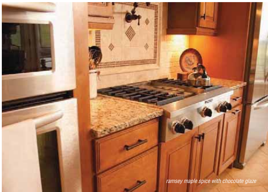
ramsey maple spice with chocolate glaze