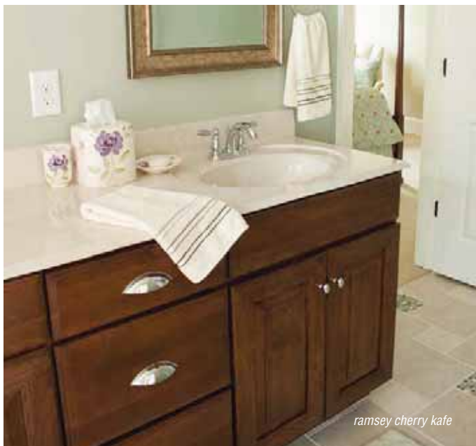
ramsey cherry kafe