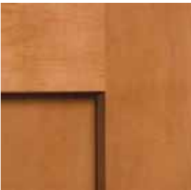
mission - full overlay mortise & tenon joinery recessed veneer panel solid wood drawer front