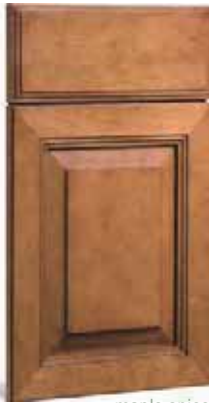
maple spice chocolate glaze