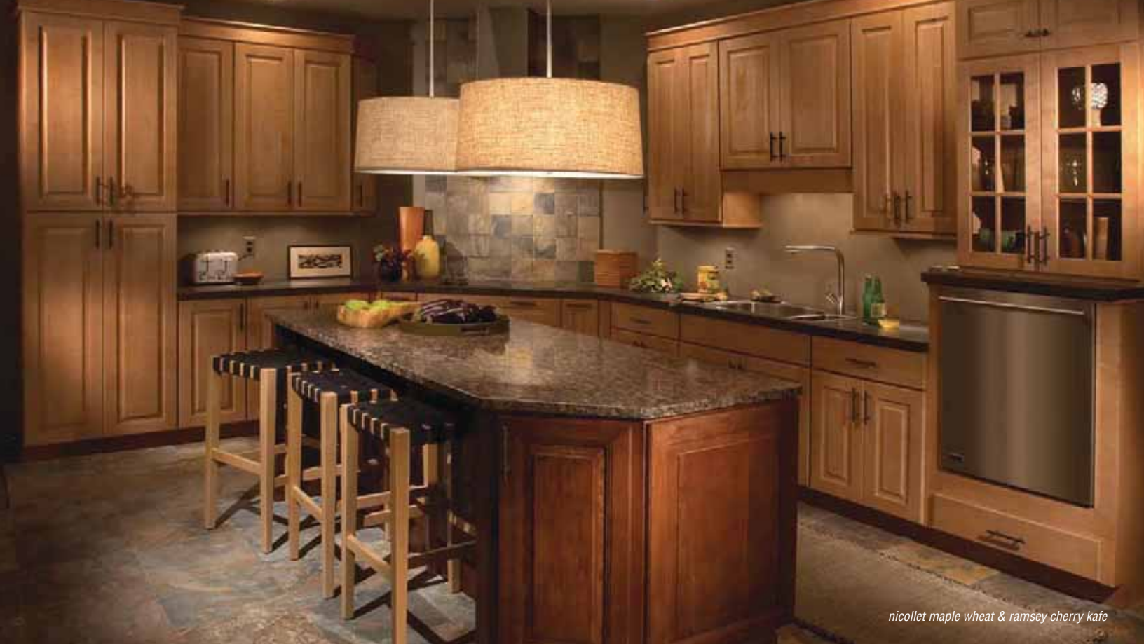
nicollet maple wheat & ramsey cherry kafe