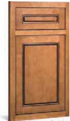
maple spice chocolate glaze