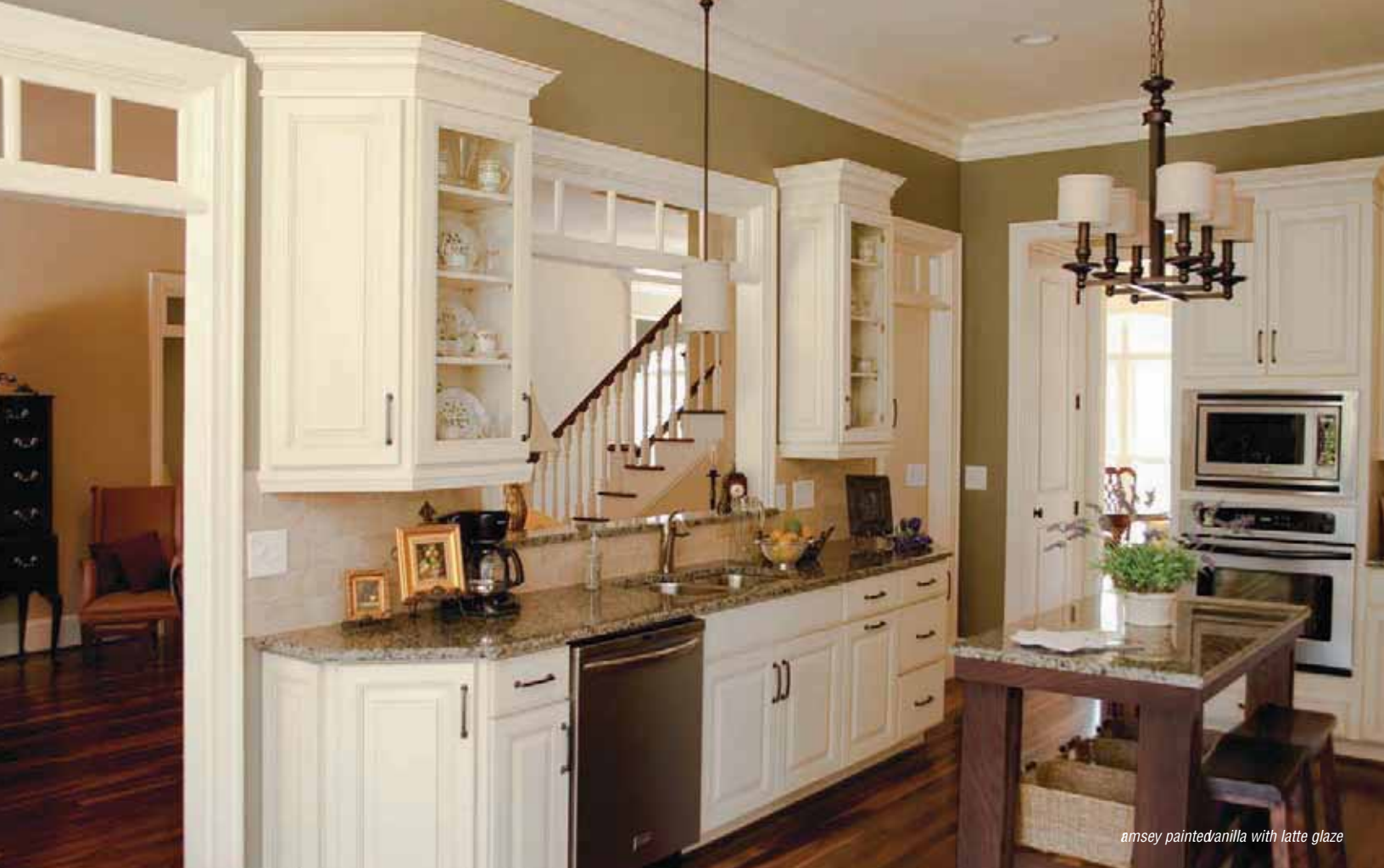
amsey painted vanilla with latte glaze