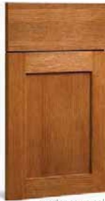
quarter sawn oak toffee