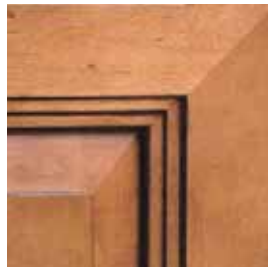
miter raised - full overlay miter door frame joints solid hardwood center solid wood drawer front