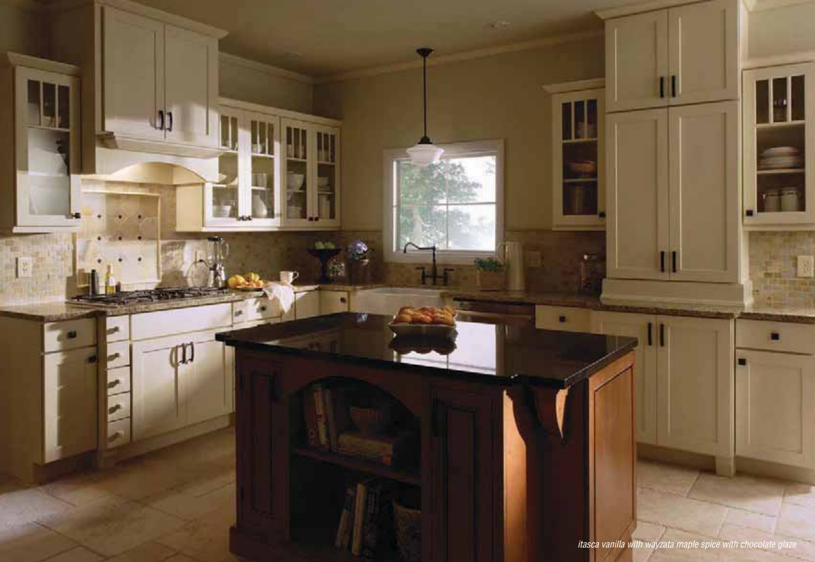
itasca vanilla with wayzata maple spice with chocolate glaze