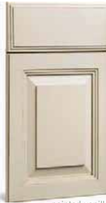
painted vanilla latte glaze